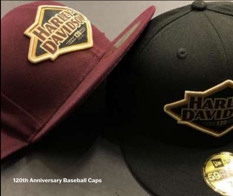
120th Anniversary Baseball Caps