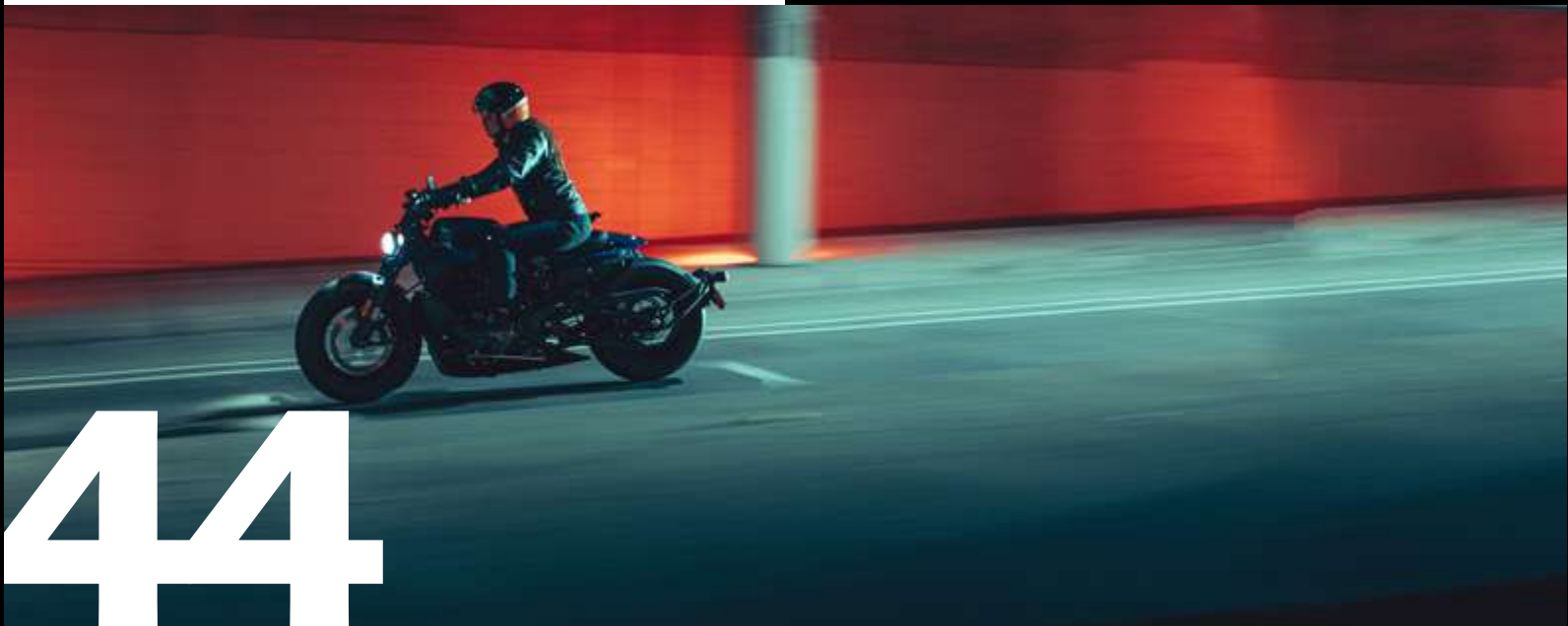
Adventure Touring lineup