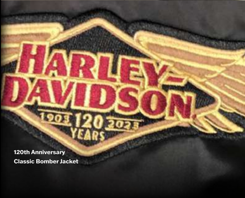
120th Anniversary Classic Bomber Jacket