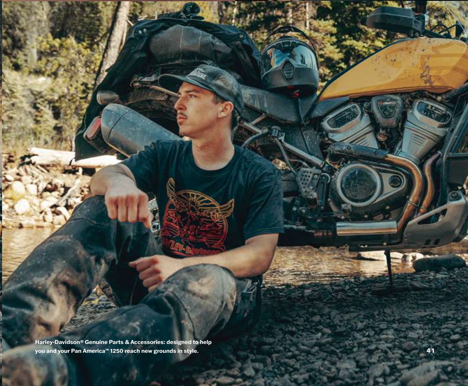
Harley-Davidson® Genuine Parts & Accessories: designed to help you and your Pan America™ 1250 reach new grounds in style.