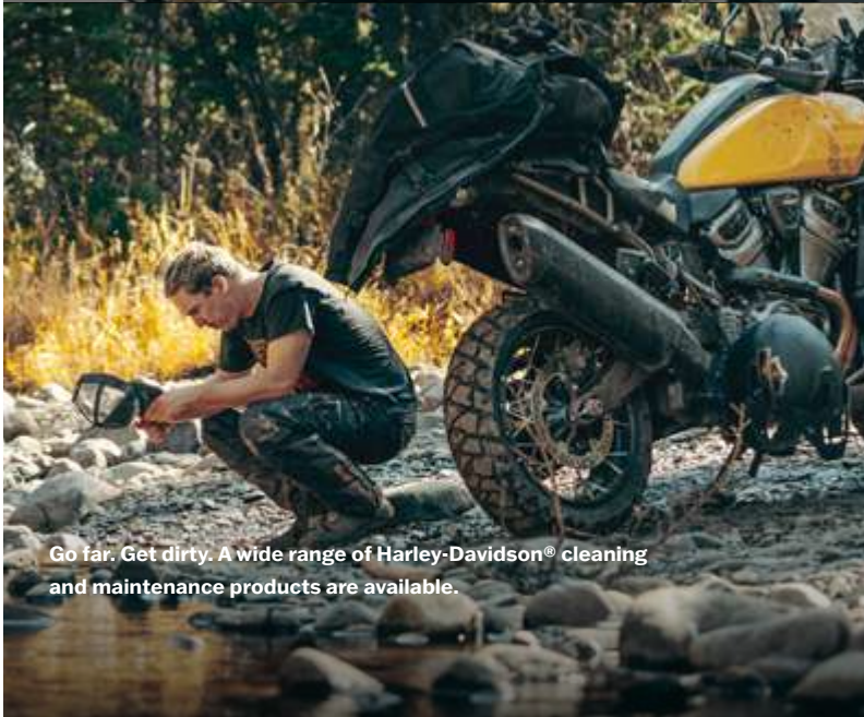
Go far. Get dirty. A wide range of Harley-Davidson® cleaning and maintenance products are available.