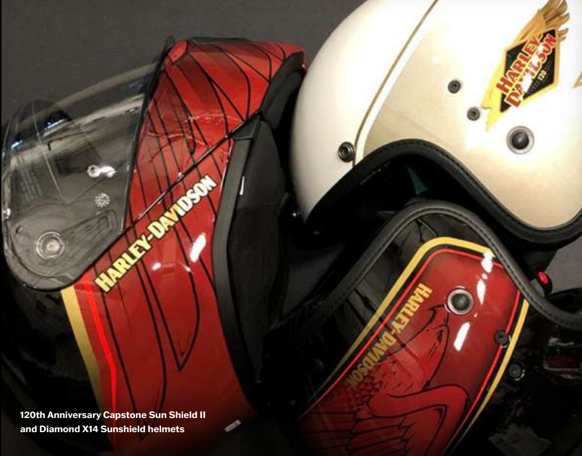
120th Anniversary Capstone Sun Shield II and Diamond X14 Sunshield helmets

2023 marks the 120th Anniversary of Harley-Davidson®. This extra special chapter in our history will be a time to celebrate and create memories. Our exclusive range of distinctive 120th Anniversary Harley-Davidson® MotorClothes® gear and apparel will go some way to make those memories last forever. Just like our motorcycles, the 120th Anniversary apparel line-up is impressive with something for everyone. From helmets to gloves, Tees to riding jackets and more, each carefully selected piece will feature a unique 120th Anniversary logo. Memories are made. Make yours today.