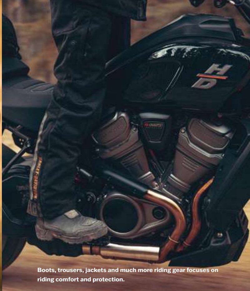
Boots, trousers, jackets and much more riding gear focuses on riding comfort and protection.