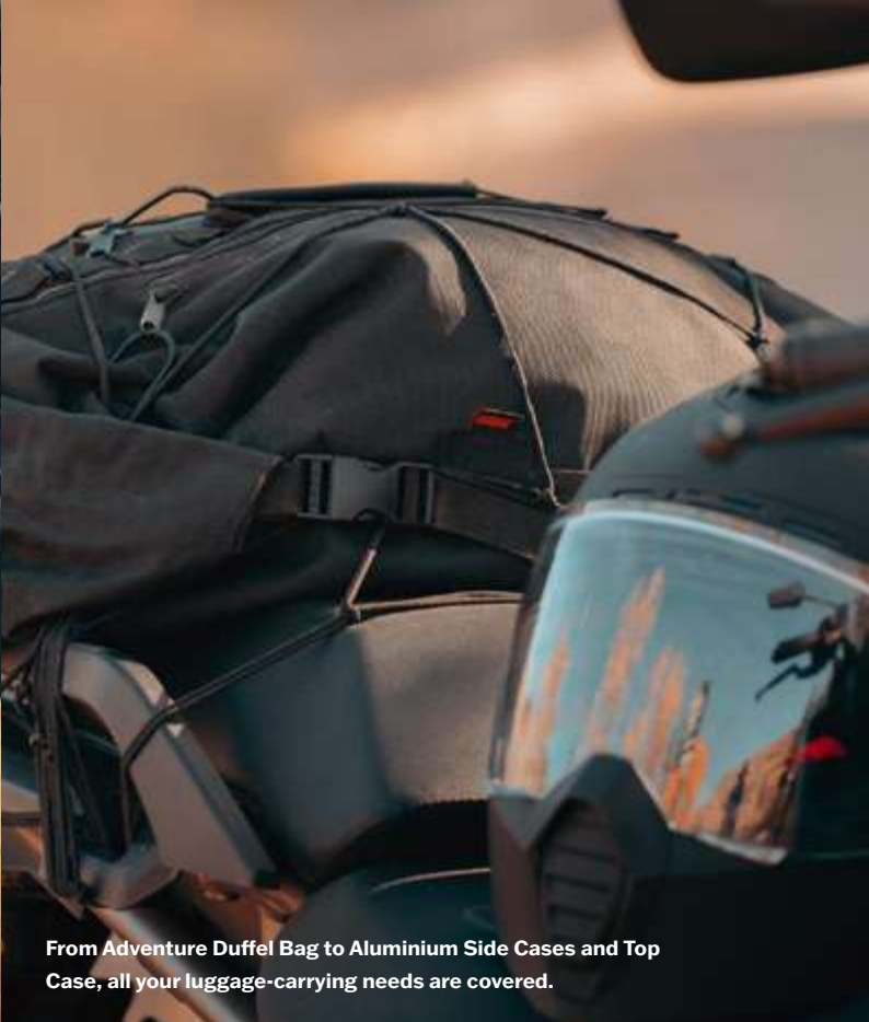
From Adventure Duffel Bag to Aluminium Side Cases and Top Case, all your luggage-carrying needs are covered.