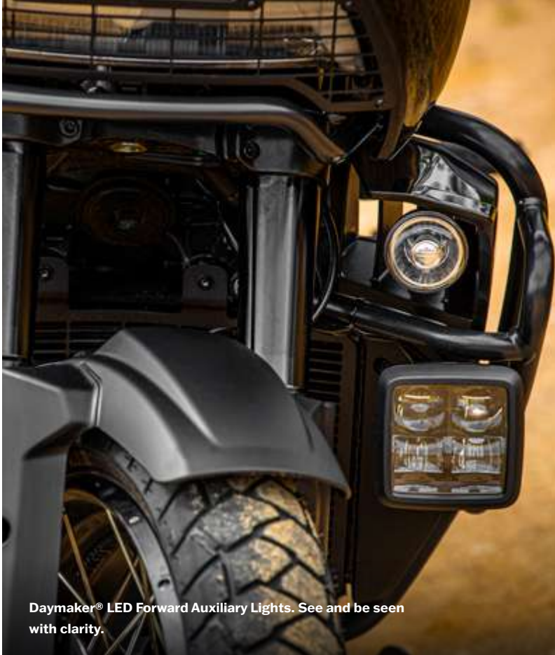
Daymaker® LED Forward Auxiliary Lights. See and be seen with clarity.

Owning and riding a Pan America™ is just the start of your next adventure. Make sure you're equipped with Harley-Davidson® Genuine Parts & Accessories and riding gear before you start exploring. Night or day. Hot or cold. Smooth roads or off-road mountain tracks. You'll find everything you need at your local H-D® dealership.