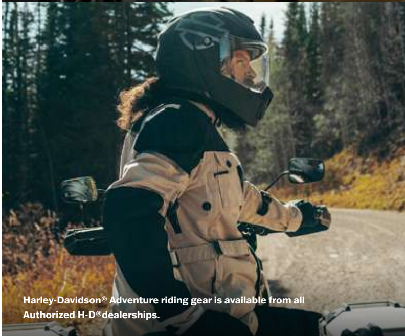
Harley-Davidson® Adventure riding gear is available from all Authorized H-D® dealerships.