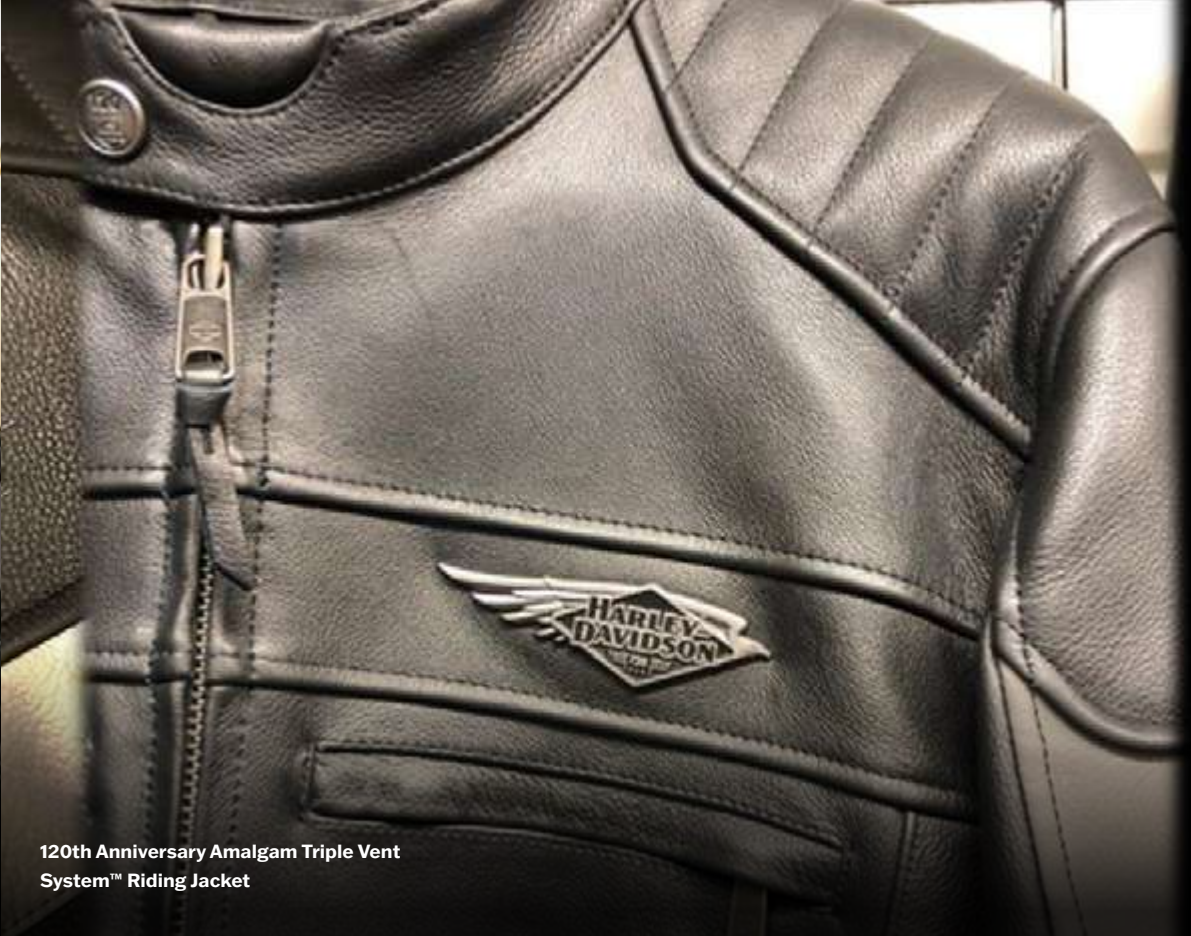
120th Anniversary Amalgam Triple Vent System™ Riding Jacket