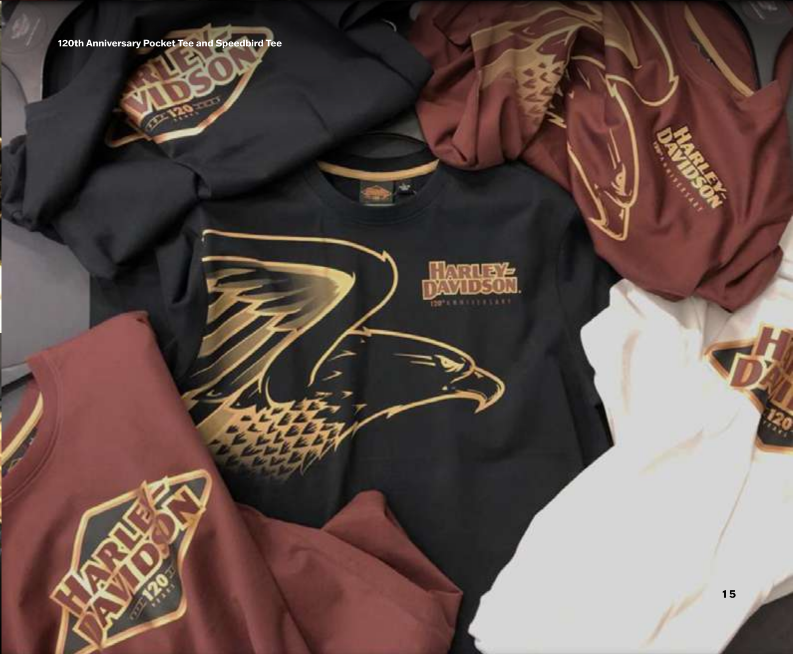
120th Anniversary Pocket Tee and Speedbird Tee